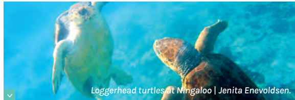
Loggerhead turtles at Ningaloo | Jenita Enevoldsen.