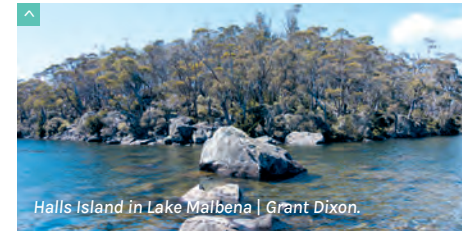
Halls Island in Lake Malbena

In our continuing work to protect Lake Malbena we launched a Supreme Court challenge to assess the underlying process that would allow private development in the Tasmanian Wilderness World Heritage Area. Update: the Supreme Court recently found in our favour!